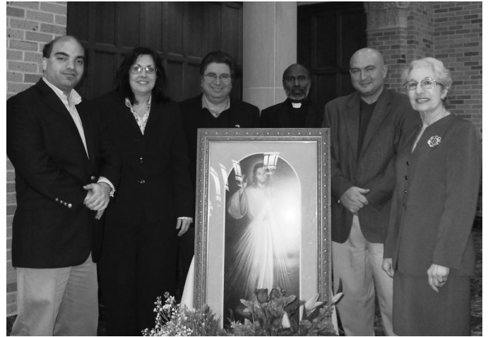
Hosts of APR St. Gregory the Great Respect Group, Harrison, NY