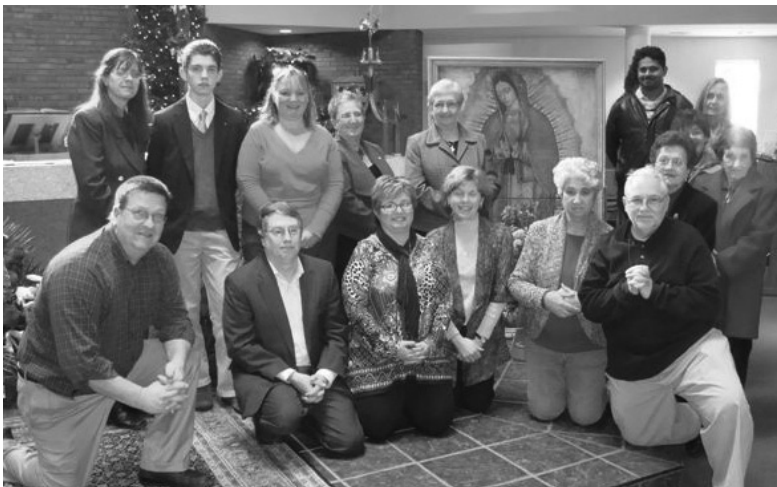
Prayerful Remembrance Providence Volunteers