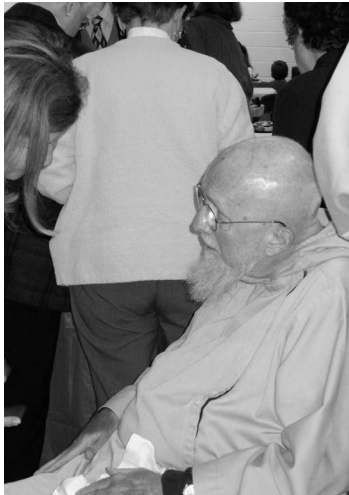
Fr Benedict Groeschel, CFR, at GC concert.