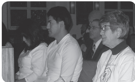
Spanish "Evening of Prayerful Remembrance" St. Phil Neri, Bronx, NY