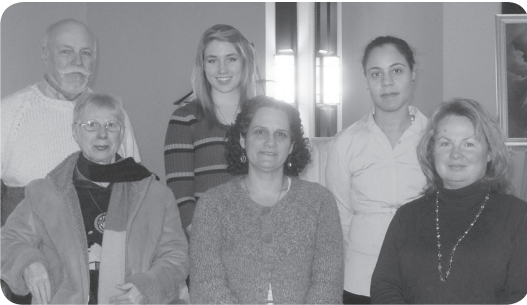
Afternoon of Prayerful Remembrance, Sacred Heart, Monroe, NY